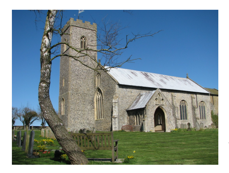
(Extract from 'A Church Near You' website)

This is an amazing and beautiful building, and the roof is just stunning! Knapton is part of the Trunch Team. The beauty and history of this church is amazing. Remember too that there has been worship and prayer and praise in this building for hundreds of years. You are welcome! Come to a service, or just to admire the dedication and skill of the workmanship. The church of St. Peter & St. Paul is mainly 14th century although there is evidence of an earlier church which no doubt housed the impressive 13th century font.