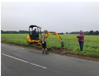
Digging out the crossing

This is yet another example of a issue dating back many years, long talked about but never resolved. But in keeping with the current Parish Council's mantra, we will "get it done".