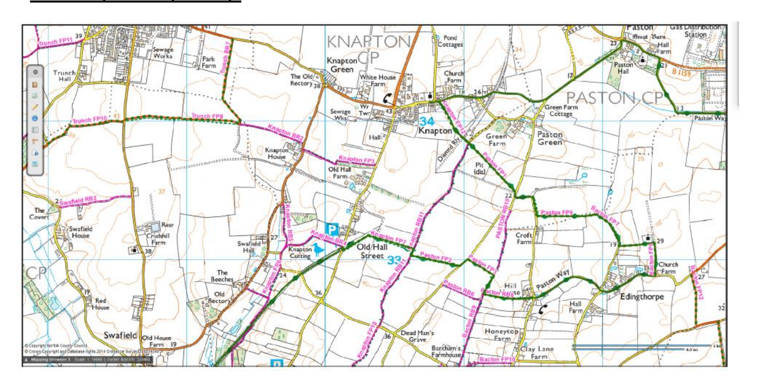
If you have any old photos of the footpath from the Water Tower to Knapton Green please let the Parish Council know.