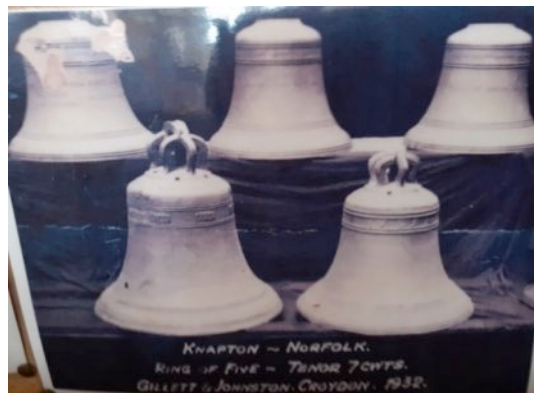
The Five Bells as at 1932.