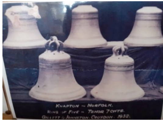
The Five Bells as at 1932.